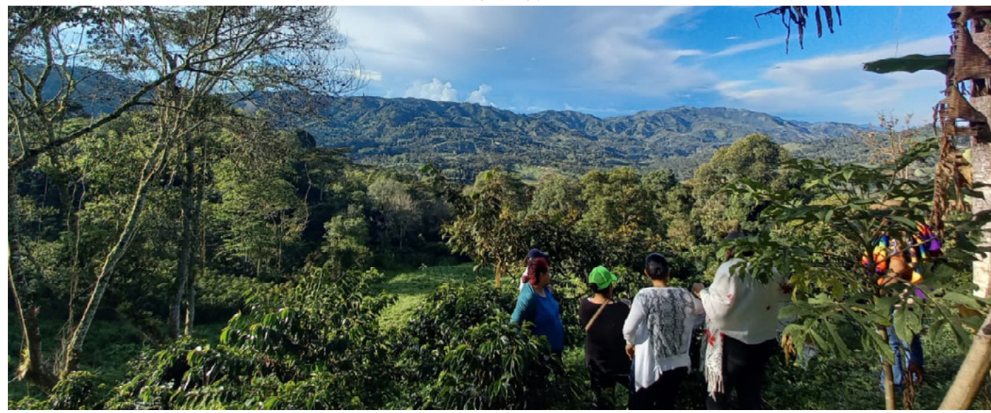
Women that are part of the Aremos Paz project learn about the coffee growing process in Huila, Colombia.

ForumCiv believes that civil society organizations have a central role to play in the work for a just and sustainable world, therefore we work to strengthen civil society's capacity . Here too, it is important to have an equal partnership between ForumCiv, the member organizations, and the partner organizations, and an understanding that all partners can learn a lot from each other. For ForumCiv, it is particularly important to promote opportunities for organizing and to strengthen democratic forces within civil society. We see three functions as particularly important for civil society to contribute to democratization and development: